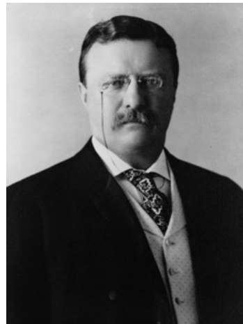
Pres. Theodore Roosevelt