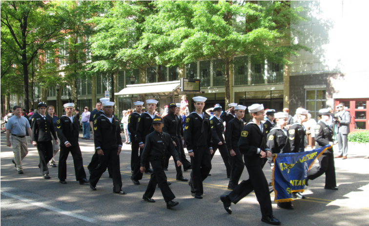
5. Cadets and leaders from the Hurricane and Signal Mountain Divisions march in the Armed Forces Day Parade.