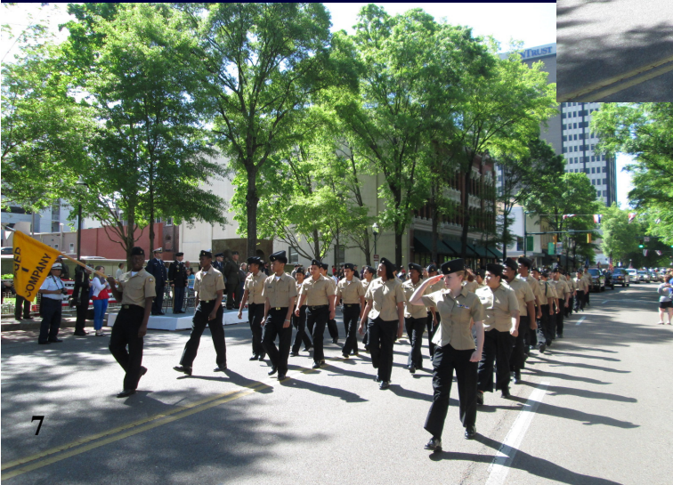
7. The Howard School NJROTC Unit renders honors as the Cadets pass the reviewing stand.