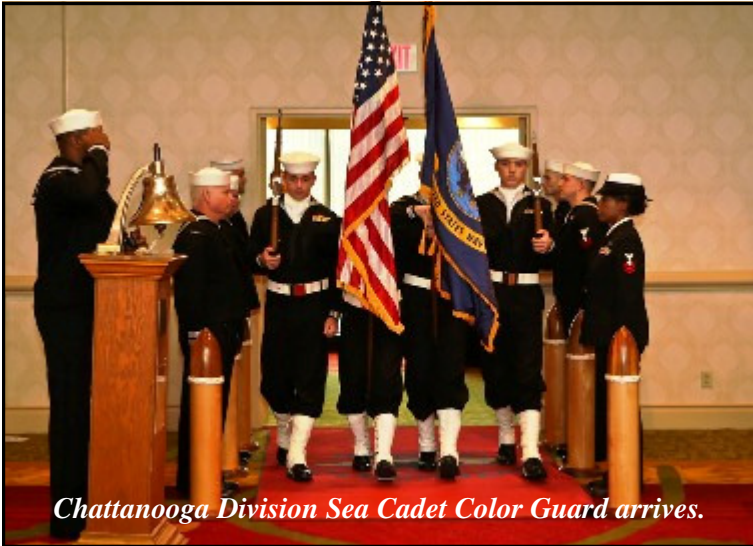
Chattanooga Division Sea Cadet Color Guard arrives.

They say it couldn't be done! Putting together everything needed for the Navy Ball in less than 90 days was accomplished – something it traditionally took a year to nail down the venue, arrange for donated dinner, raffle gifts, guest speakers, music, the works.