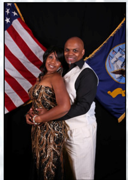
Featured immediately above is a small sampling of the hundreds of attendees enjoying fun times at the Navy Ball.