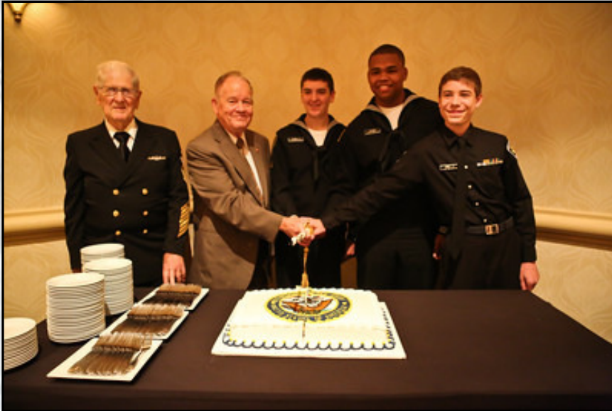
Slicing the 241st Birthday Cake.