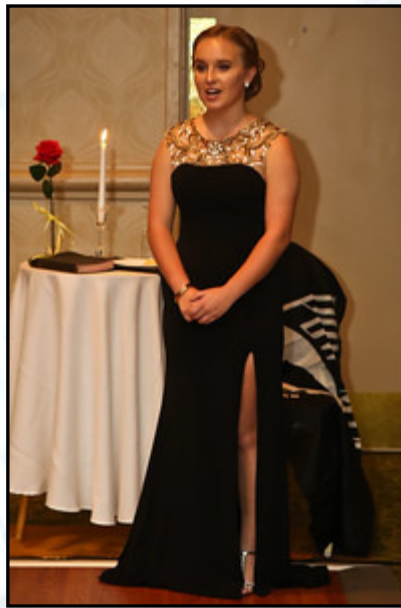
A beautiful young lady serving as Hostess.