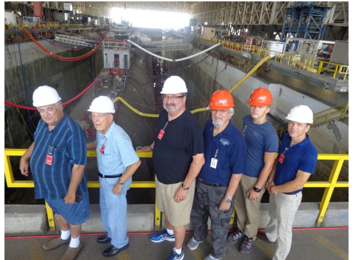
Security cleared inspectors of the USS Tennessee.

However the existing fleet and the newest SSBN's are phenomenally capable. He cited that a single SSBN has the ability to wipe out an entire country, or even a small continent -- so maybe we are getting a bargain. Of course, the whole idea of SSBN's is to make it prohibitively dangerous for any country to launch a nuclear strike thus obviating the need to use this massive power.