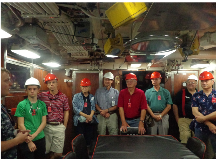
Gathered around the Tennessee's wardroom dinner table -- with nothing secret in the background! If you don't like the meal, the overhead lamp is so they can do surgery.

The Good News is that no one is going to be checking the Compass Point servers for anything.