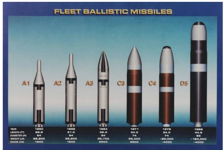
Evolution of ballistic missiles for subs.