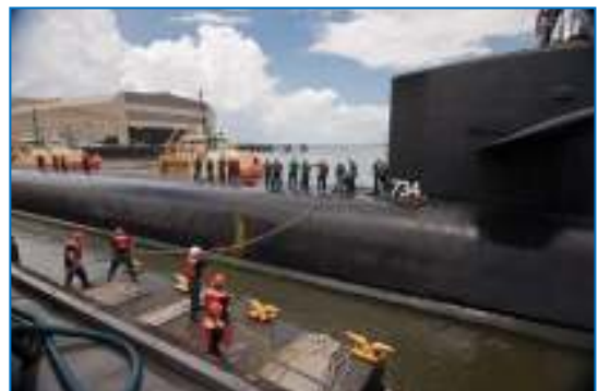
USS Tennessee SSBN 734 casting off