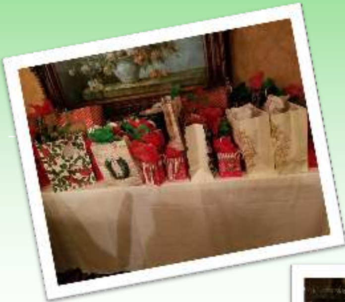
Only 26 more shopping days until Christmas and Stacy had already scooped up everything !