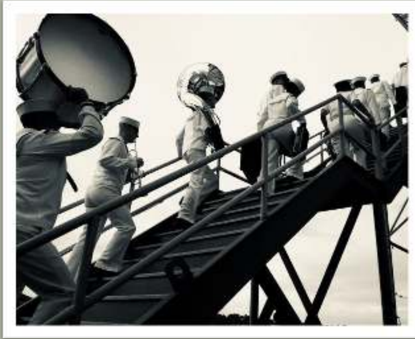
“Stairway to Heaven” —the Coke stage. US Navy put Chattanooga on its map.