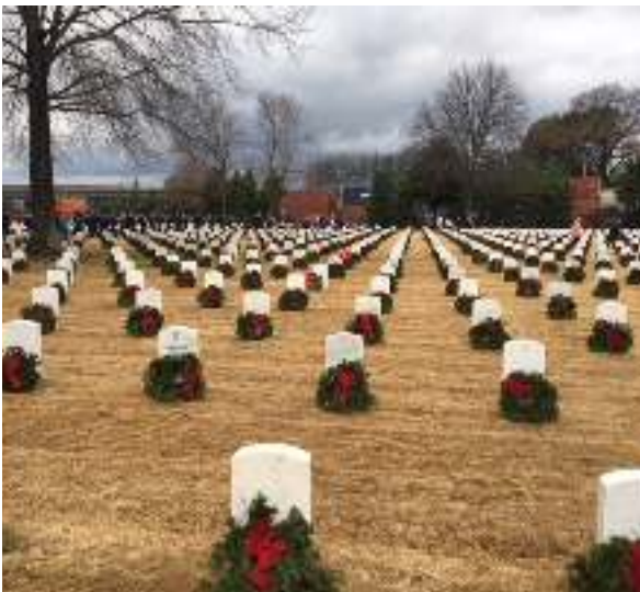
Chattanooga National Cemetery—Dec 15, 2018 Our members' contributions helped

A timely inflow of dues helps make our operations run smoother! Thanks go out to these members who have already sent in their Happy New Year 2019 local dues .