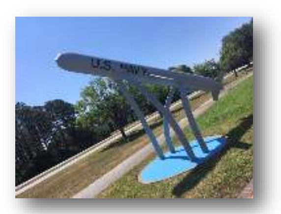
Torpedo on a Stick?