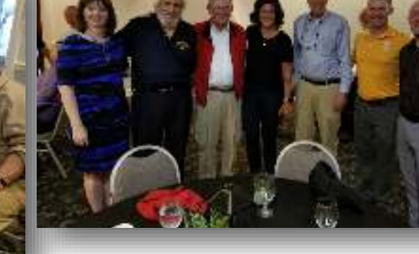
Not everyone — but we caught most