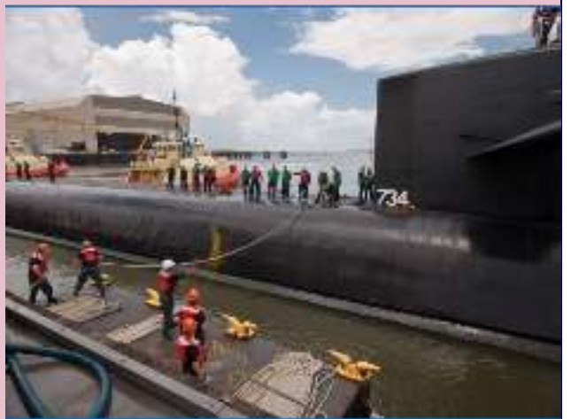
USS Tennessee SSBN 734 casting off