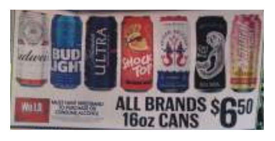
$6.50 ! Well.....It was a large can

Our beer "tent" this year was not actually a "tent" ... more like an "underpass overhead covering"! We