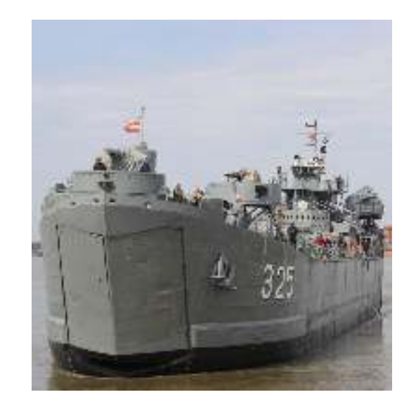
USS LST 325—veteran of WWII

More details about visitation will be divulged in the weeks ahead. If anyone has interest in or ideas on how we might make this visit special, pleased contact Willard Rice : Wkrice@aol.com or cell phone 603 557 7224