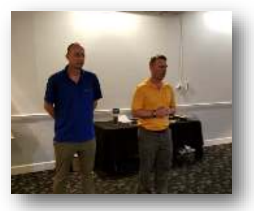
The Blue...and the Gold

We arrived back at McCallie at roughly midnight to pick up our cars, which were located in a secure parking lot. We are thankful and fortunate to have had McCallie give us permission to park our cars in their parking lot and to load and unload our bus at the school.