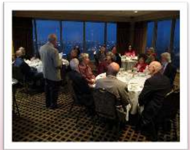
Is there a better view in Chattanooga?