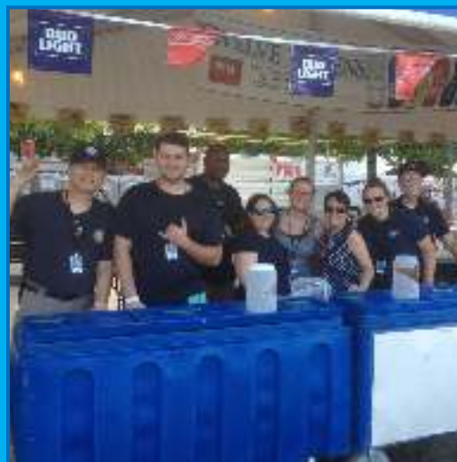
Part of the 2017 beer tent crew.

Now back to the Few Good Men and Women – Need message back ASAP from anyone who wants to help with any questions &/or times when you can help. Best if you can make contact by April 12 so the best plan can be made.