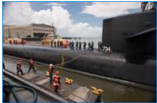
USS Tennessee SSBN 734 casting off

Cost per attendee is $220 including the dinner with the crew at the Millhouse Steak House and the round-trip bus fare, regardless if you drive your own car or are a round trip passenger on the bus. Your Microtel Hotel room and extras are the attendee's responsibility, as are lunch on Friday on the way to Kingsland, lunch on Saturday and dinner Sunday night on the return trip to Chattanooga. Free buffet breakfast at the hotel Sat morn.