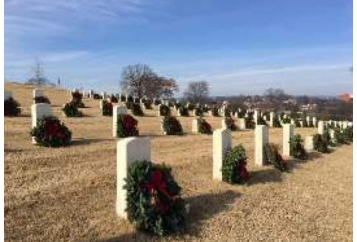
Wreaths at Chattanooga National Cemetery .....last December