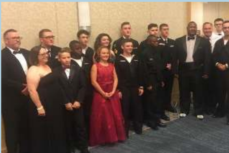
Sea Cadets, Families & Friends