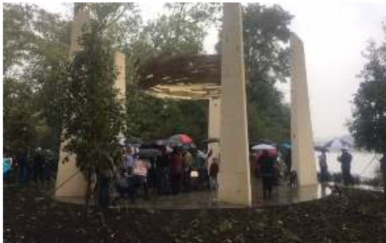
They gathered in the rain ..but it was a bright hopeful day

As Colonel Russo implored: "lest we forget".