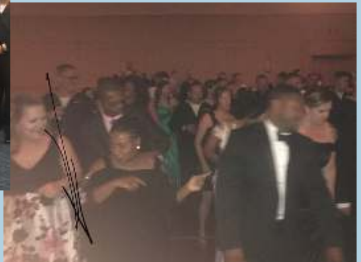
Dance floor was jumpin'