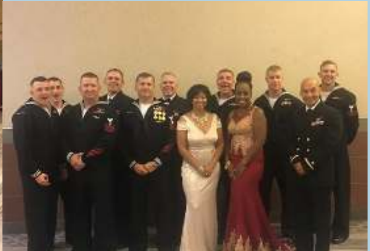
The NOSC "surge" group .....they work & party together.