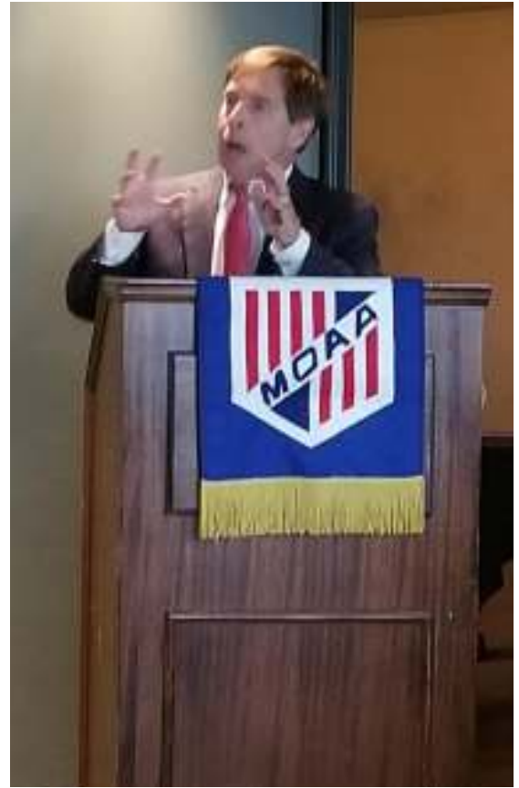
US Congressman Chuck Fleischmann addressing MOAA and Navy League guests

Congressman Fleischmann also stated that he was involved with the following subcommittees: Homeland Security, Energy and Water, and Labor, Health, and Human Services, Education, and related agencies. Congressman Fleischmann noted that Congress has been heavily involved on issues associated with the COVID-19 virus and he anticipated that a bill would soon pass to provide more money to people that needed hardship financial assistance. At the end of his speech, he fielded questions from the floor – the answers to which rounded out awareness on many issues.