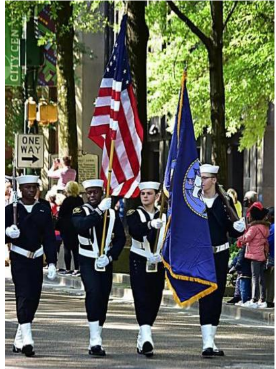
The Sea Cadets lead the way

It was a great day and, although plans for a Navy speaker at the lunch fell through, U.S. Congressman Mark Green did a great job of telling the military story with his extremely relevant experiences in the Mideast conflicts. After the delayed and