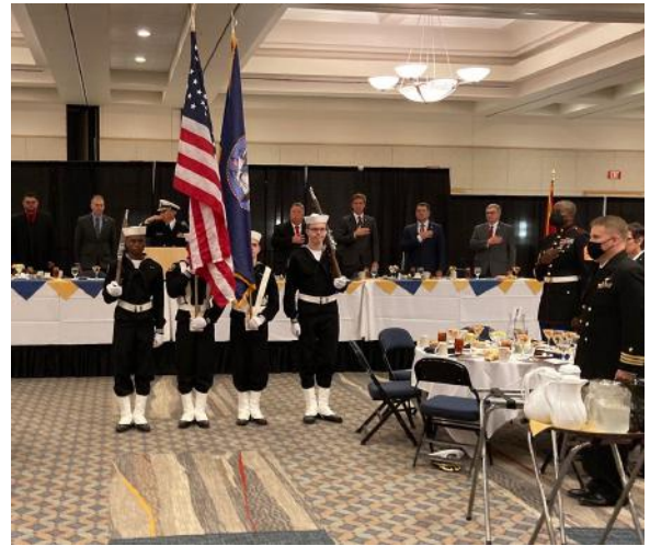
Sea Cadet Color Guard, after leading the Armed Forces Parade, brought the Colors to start the official lunch celebration

The Chattanooga Sea Cadets' roster is 18 cadets with several more in the pipeline. Eight officers