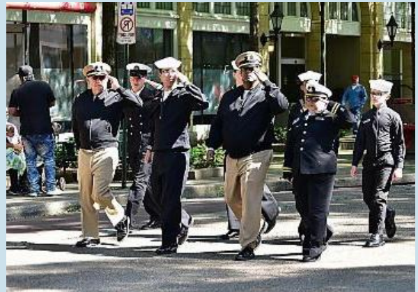
Eyes left ..... Sea Cadet Leaders