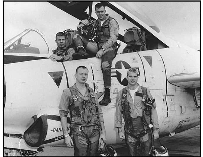
Lieutenant McCain (front right) with his squadron and T2 Buckeye trainer, 1965.