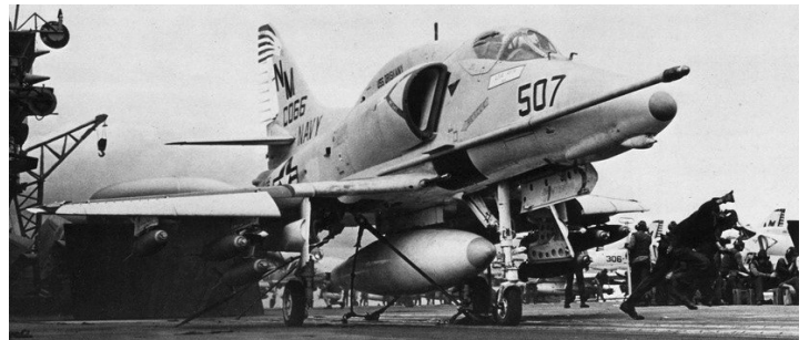
The A4 Skyhawk on carrier deck - the model McCain flew when shot down.